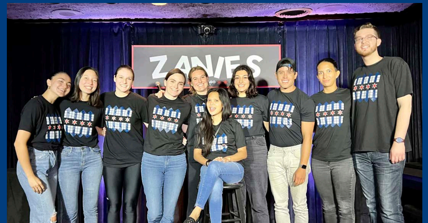
Renaissance’s amazing Associate Board members on stage at Zanies for Stand Up for the Homeless .